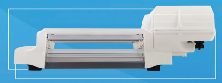
571mm / 22.5'